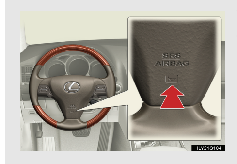
To sound the horn, press on or close to the 🔭 mark.